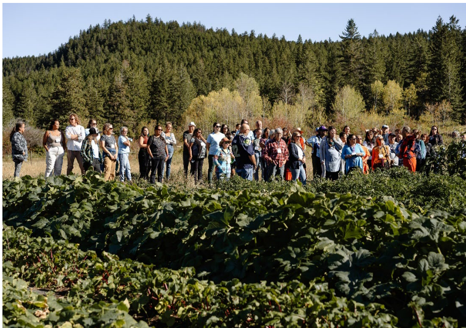
Figure 2: Esk'et Garden Tour