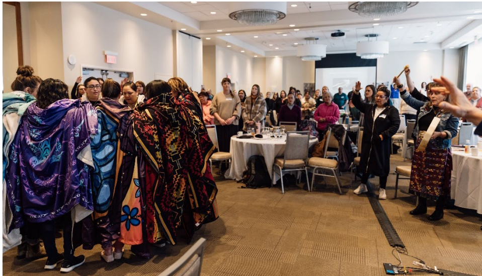
Figure 1: Blanket ceremony to honour IH Indigenous Patient Navigators